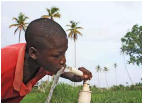
(above, middle) Haitian boy drinking from a well-like tube.