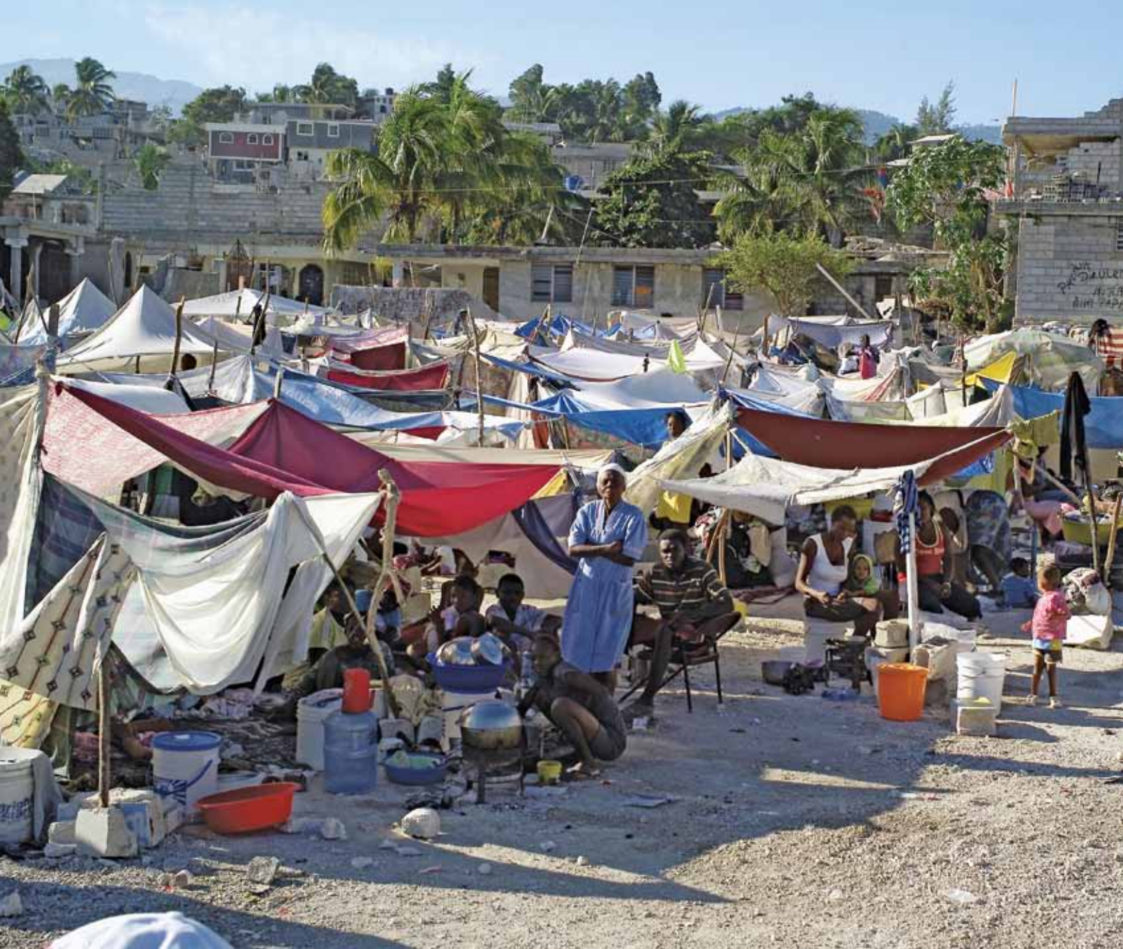
(above) A typical tent camp in Port-au-Prince for victims of the Haiti earthquake.