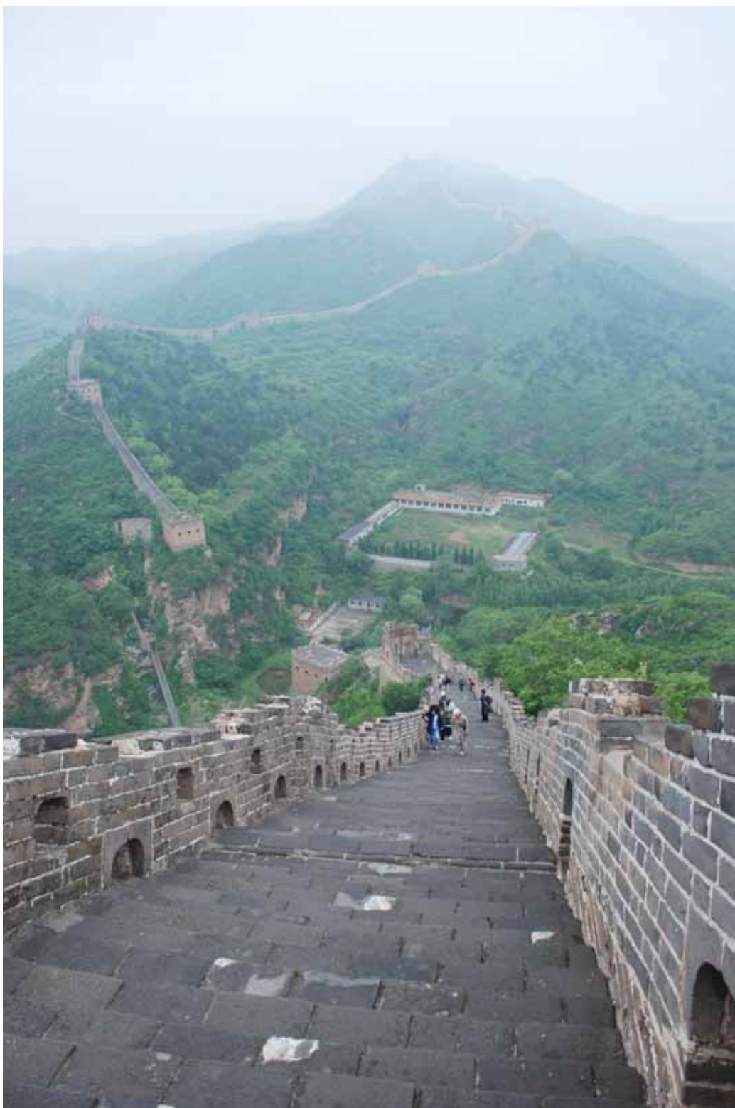
(above) The delegation spent an afternoon touring the Great Wall, a UNESCO World Heritage Centre.