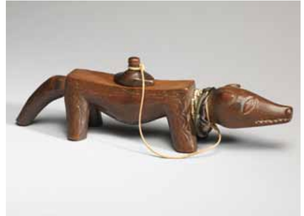
Friction oracle ( Itombwe ). Kuba peoples, Democratic Republic of Congo. 20th century. Wood, beads, metal, fiber. L2010.5.6. Lent by Sue Trotter.

African ritual art transforms the everyday world into the world as it is religiously and morally imagined to be for the benefit of humankind.