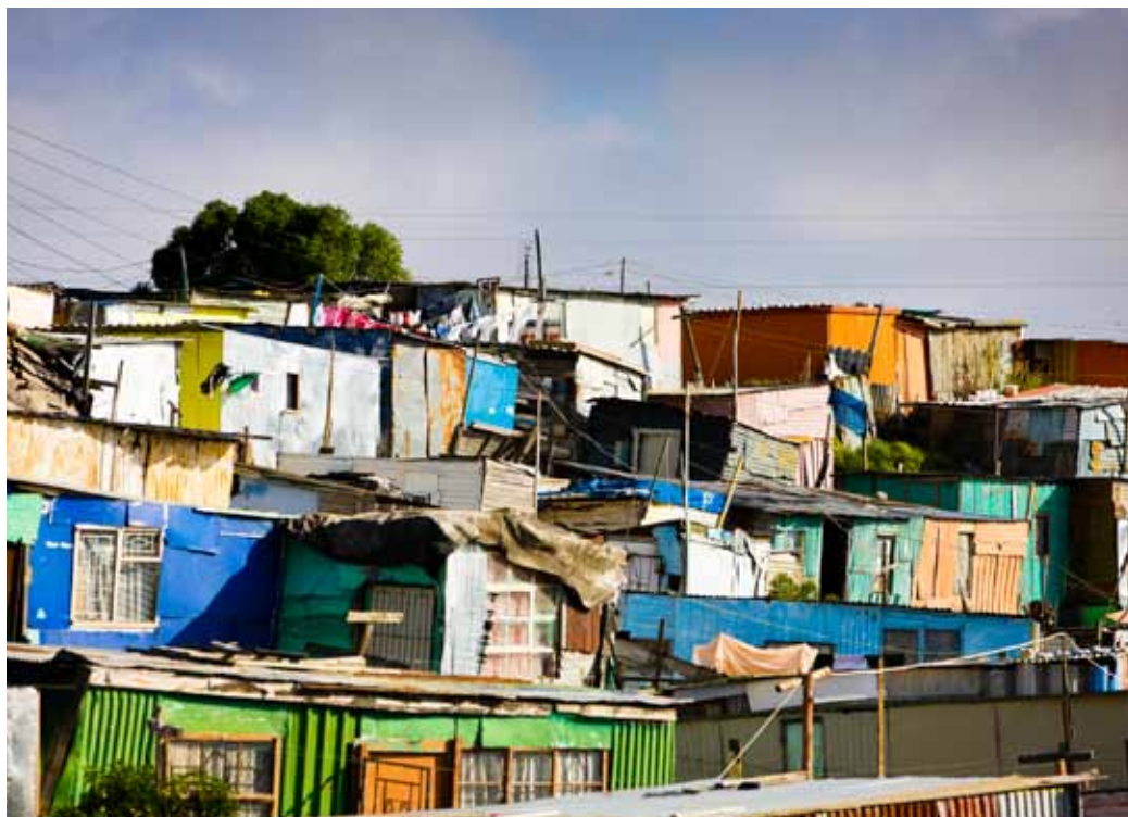
A view of the Gugulethu Township in Cape Town, South Africa.

Through the van window, I saw children running on the dirt roads past detached train boxcars; inside one of