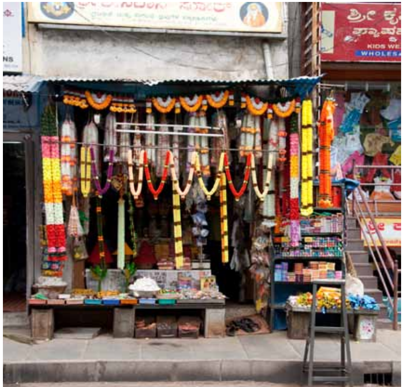
(far left) Misbatea storefront with owners in the Shivaji Nagar neighborhood of Bangalore, India.

In my neighborhood, I met a family from Mangalore and discovered that they shopped almost exclusively at shops owned by fellow emigrants. I began to think that perhaps this was a cultural choice, a chance each day to reaffirm their roots, speak the language of their home state, and reconnect with their home villages within the teeming metropolis of Bangalore. Perhaps the neighborhood shops reflected a subtle pattern of diverse and shared cultures. These thoughts formed the foundation for my current book.