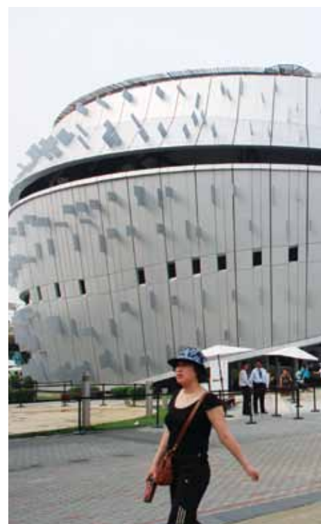
(top right) The Singapore pavilion at the 2010 Expo in Shanghai, China.

visitors understand this important part of Chinese history.