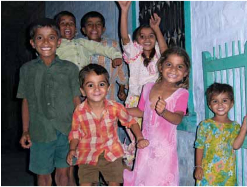
(left) Neighborhood children excited to be caught on film.

see children running, some barefoot, chasing our car. The school building was a faded hue of light blue both inside and out. As I was later told, this color is prominent in western Rajasthan because it keeps the homes and buildings cooler.