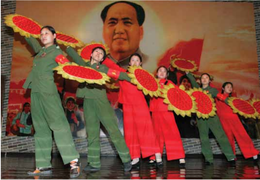
Chinese performers dance in front of a portrait of the late Chairman Mao Zedong at a restaurant named Red Classic in Beijing on April 7, 2006. Red Classic is a theme restaurant based on the Chinese Cultural Revolution (1966–1976). The restaurant is decorated with posters from the period while customers, served by waiters and waitress dressed as Red Guards, enjoy revolutionary songs and dance performances.

and romanticized the ideals of the struggle. The Communist fighters were resourceful and always won, while their enemies were totally incorrigible and invariably lost in the end, despite gaining an upper hand temporarily. The Red Classics dominated communist literature in the first seventeen years of the PRC. The same stories and communist heroes were pounded into people's consciousness and circulated in different formats, such as textbooks, children's picture books, movies, musicals, radio broadcasts, Peking operas, and local operas. Again, literature helped produce a common history to unite the country.