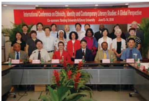
(left) The Emory delegation and its foreign counterparts prior to the opening of the International Conference on Ethnicity, Identity, and Contemporary Literary Studies in Nanjing, China.

although I didn't know them or their culture deeply, I had visited their country, had seen their sunrise and sunset, and had made the same exhausting eleven- to thirteen-hour journey from China to Atlanta.