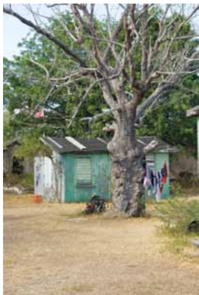
Eleuthera Island, formed on top of a coral reef, is one of the Out Islands of the Bahamas.

the first thoughts are of turquoise waters, swaying palm trees, white sand beaches, and lounging with a coconut rum drink in hand. Although all these images are certainly true of the beautiful island nation, life in the Bahamas is not always so simple and serene.