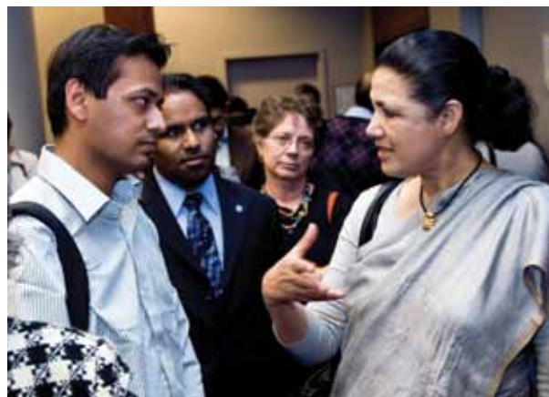
(above) Ambassador Meera Shankar meets with Emory students and faculty members after delivering her keynote address at the 2011 Emerging India Summit.

and our increasingly convergent interests provide a firm foundation for our relationship. We see our relationship with the U.S., which is one of our largest trade, investment, and technology partners, as a vital element of our endeavour to transform our socioeconomic conditions. The highly successful visit of President Obama to India last November has significantly expanded and deepened our cooperation particularly in areas such as health, education, agriculture, infrastructure, trade, and commerce, which are vital for our own development. These areas also represent tremendous opportunities for American businesses and companies, and will further strengthen the bonds between our peoples. Our relationship with the U.S. is people-centric and nourished by the many personal connections. The Indian American community, at nearly three million strong, has come of age and is a vital bridge between our nations.