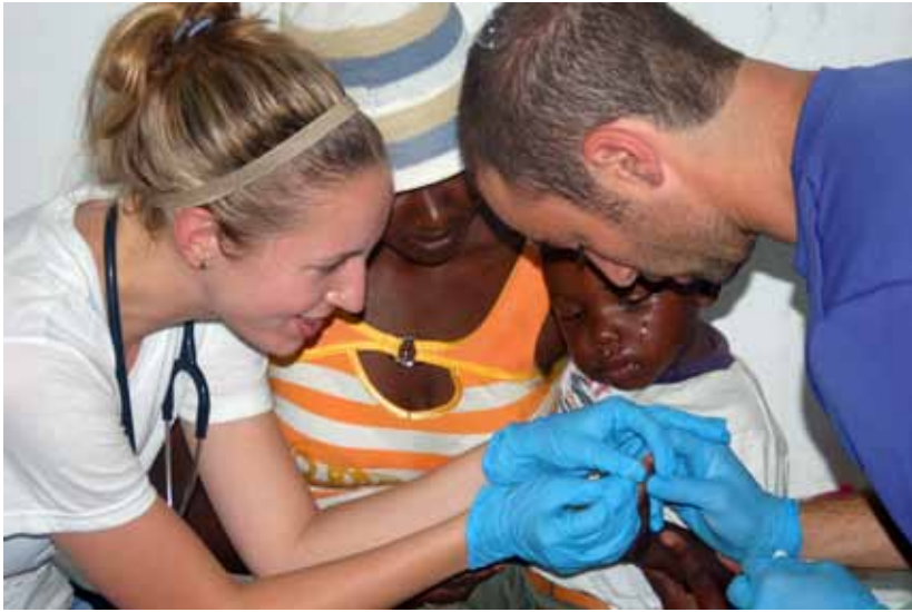
(above, top) A young boy, held by his mother, watches as Emory students prick his finger to check his hemoglobin level.