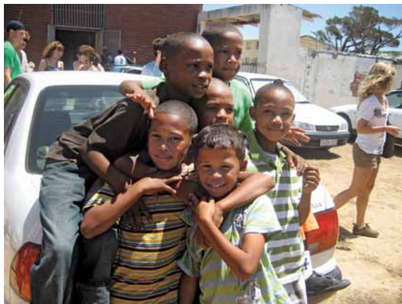
Local children in a township near Cape Point.