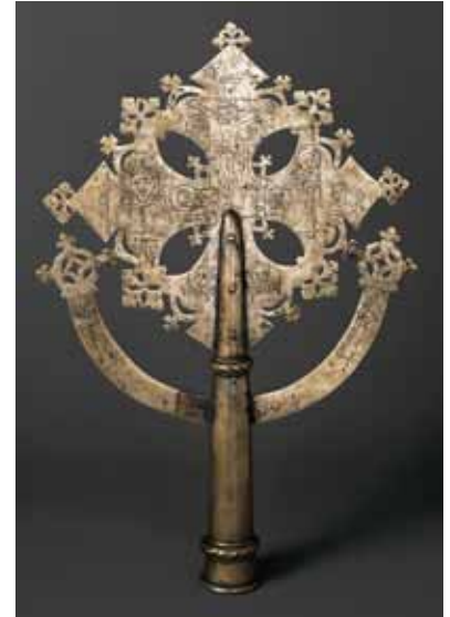
Processional cross. Ethiopia, Gondar. Late 1700s. Brass. 2005.65.1. Museum Purchase.