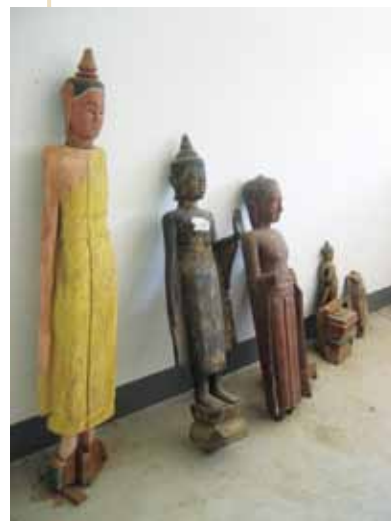
(above) Artifacts awaiting processing at the Angkor Conservation.